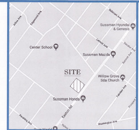
LOCATION MAP SCALE: 1"=50'