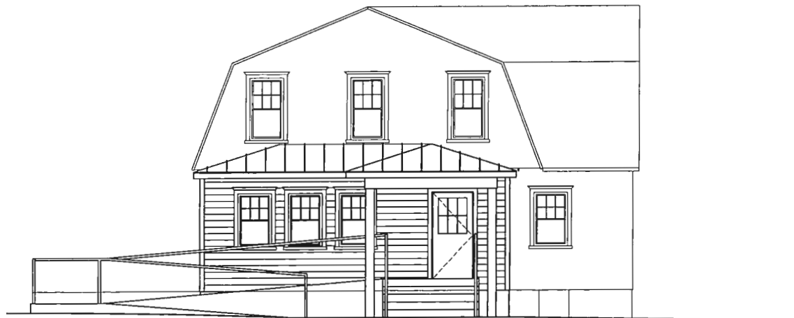
2 PROPOSED BACK ELEVATION SK-2 SCALE: 1/4" = 1'-0"