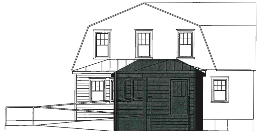
1 OUTLINE OF EXISTING PORCH SK-2 SCALE: 1/4" = 1'-0"